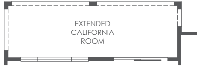
OPTIONAL EXTENDED CALIFORNIA ROOM